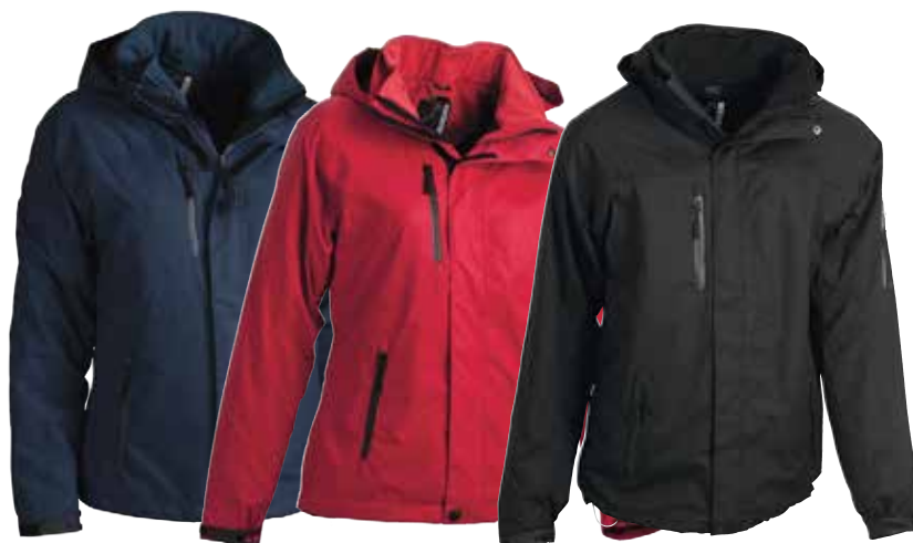
Innerjacket in Softshell.

Outershell 100% polyester A.B.T. • Lining 100% nylon/mesh. • Padding Softshell 96% Polyester 4% Spandex